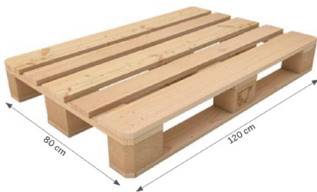
PINE EURO PALLET